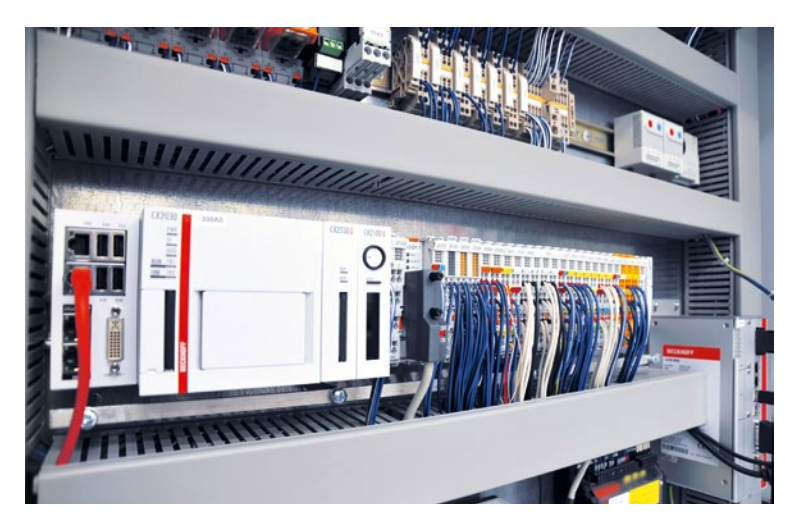
The Beckhoff CX2030 Embedded PC (left) in the tower control cabinet controls the entire system, while the C6930 control cabinet IPC (right) handles visualization, monitoring and remote access in the prototype installation.

including the option to use fiber optic cabling. Integrating the systems is also easy, because all safety data is available in the controller automatically and without any additional hardware."