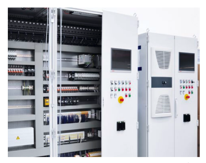
Both the tower control cabinet (right) and the nacelle control cabinet (left) of the turbine prototype use a CP2915 multi-touch Control Panel with a 15-inch screen for easy operation.