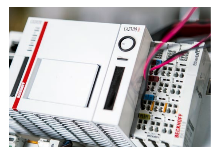
A CX2020 Embedded PC with 1.4 GHz Intel® Celeron® CPU serves as the basis of the automation system at the Minto, Ontario power facility. The PC-based control platform provides powerful operation, as well as ease of expansion and upgradeability.

The robust design of the EtherCAT Box modules has drastically reduced electrical cabinet needs on the flywheel portion of Temporal Power systems. The fullysealed I/O modules with IP 67 rating are mounted directly onto the flywheels, saving space and reducing costs. "The EtherCAT Box modules work very well for our installation needs. Since the flywheel systems are located in vaults below ground, we need protection from moisture, vibration, and temperature variation," according to Jeff Veltri.