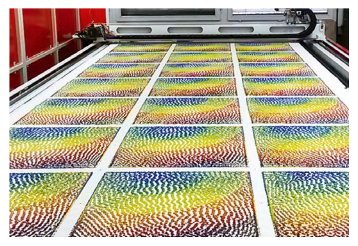
The OilPainter machine in its total length

controlled with a separate process. The paint is applied with high-precision, medical-grade pumps, whose auxiliary axes move simultaneously with the three main axes. The pumps, in turn, are driven via three EL7342 2-channel DC motor output stages. The system generates any color in a mixing chamber just ahead of the brush, proportionally with the pumps and in perfect synchronization with the motion speed – even during acceleration or deceleration."