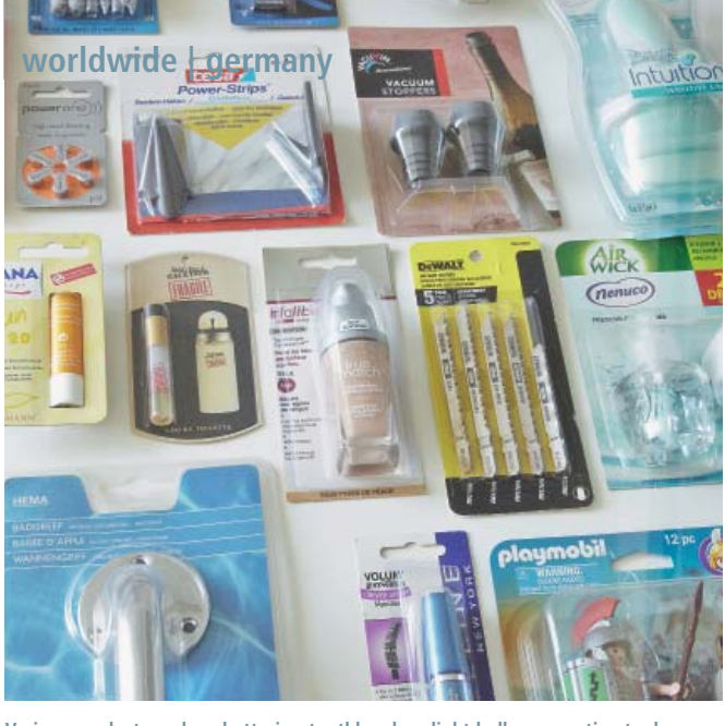
Various products such as batteries, toothbrushes, light bulbs, cosmetics, tools, electrical appliances, stationery or toys can be packed with the KBS-KF blister machine; exceptions are pharmaceutical articles, foodstuffs and luxury items.

www.koch-pac-systeme.com www.beckhoff.com/packaging