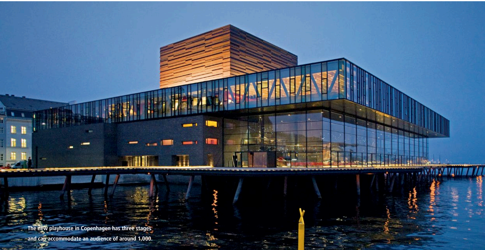
The new playhouse in Copenhagen has three stages and can accommodate an audience of around 1,000.

Automated stage technology at the Royal Danish Theater in Copenhagen